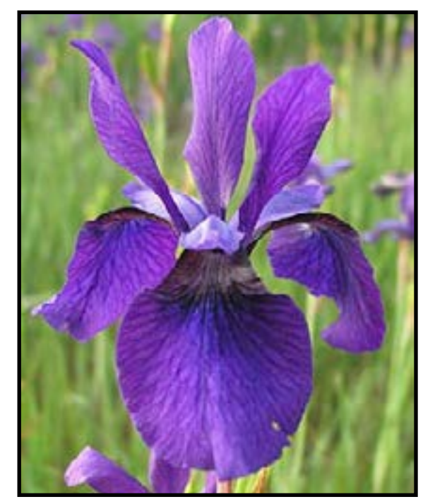
MISS DULUTH (Sass, J.) 31", M. to L., 4" $12.00

Glowing, deep velvety reddish purple with contrasting blue styles. Very pretty color combination.