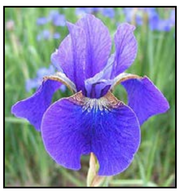
BLUE PENNANT (McEwen, C.) 30", M., 5 ¼ " (T) $15.00

Dark, blue-violet standards and falls. Blue-violet blaze with prominent yellow-white edging. Velvety texture and horizontal flaring form. Fine parent. H. M. Award.