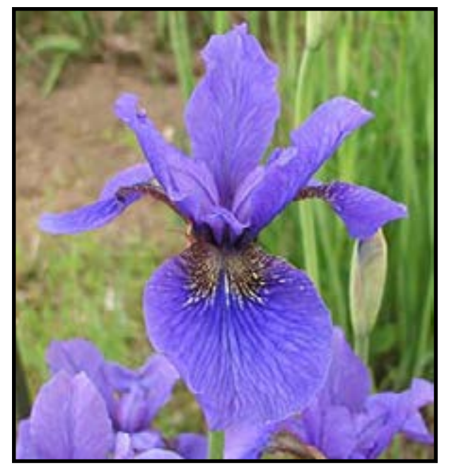
LLEWELLYN (Cleveland, F.) 38", M., 4 <sup>1</sup>/<sub>2</sub>" $10.00

Gorgeous, large, light purple-blue color that glows with lighter standards. Very large flaring standards. A favorite here.