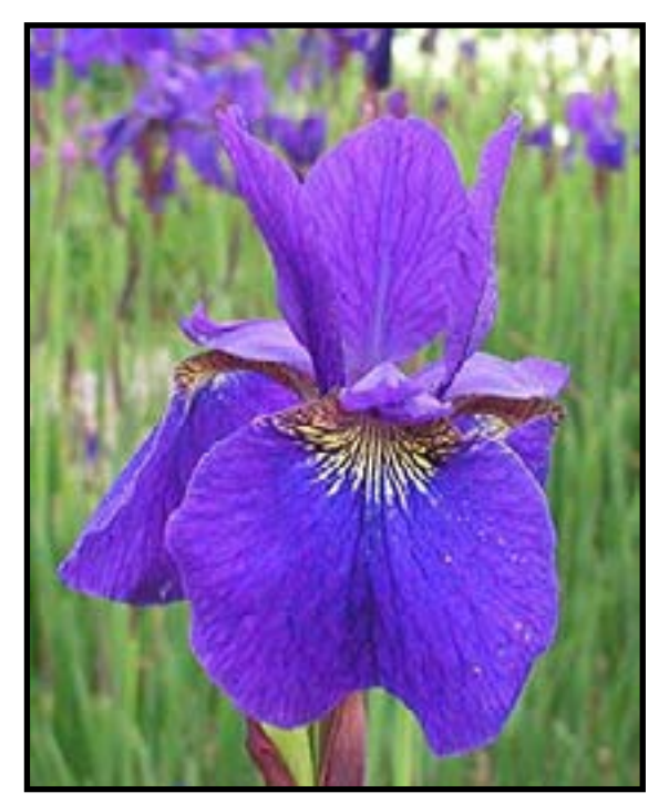
KAMAYAMA (I. sanguinea) 36", M., 3 ½" $10.00

This purple selection of Iris sanguinea has a striking flower form with pendulous falls and vertical standards.