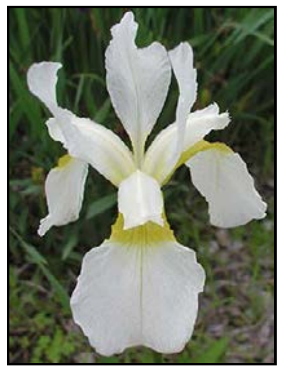
SNOWCREST (Gage, L. M.) 28", L.M., 3 <sup>1</sup>/<sub>4</sub>" $10.00

Sparkling, snow white with heavy texture and stately form. Morgan Award.