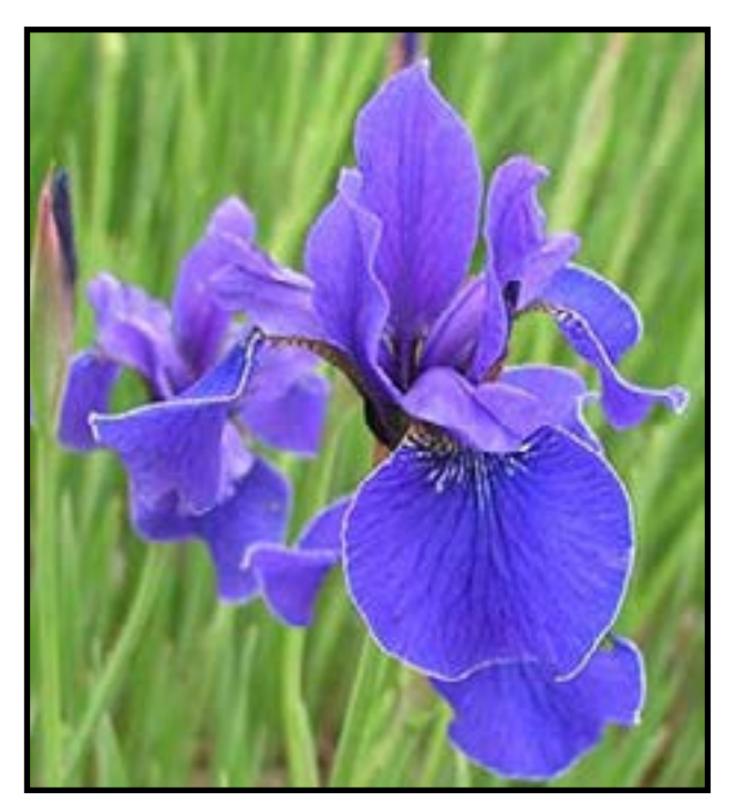
FROSTY RIM (Bush, G.) 37 ½", M., 4" $12.00 Velvety, deep blue violet, smooth falls with a thin, silvery wire edge.