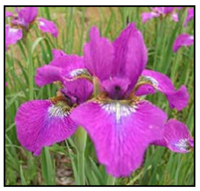
EWEN (McEwen, C.) 32", E. to M., 5 ¼" (T) $15.00

Very large, pure white with wide flaring form and yellow haft. Classic form. H. M. Award. (Cross between 'White Swirl' and 'Snowy Egret'.)