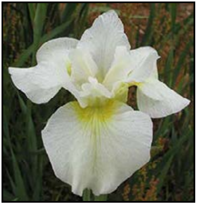
CRÈME CHANTILLY (McEwen, C.) 36", M., 5" $15.00

Ruffled and flaring, creamy white flowers changing to pure white with age. Butter-yellow blaze.