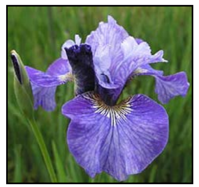
ALL IN STIPPLE (Warburton, B.) 38", M. to L., 5" $12.00

Beautifully ruffled, violet-blue standards dappled on a lighter ground in tweed like fashion, rimmed with a dark violet blue. Falls same, tweed-like rim circling white sunburst signal that is mostly concealed by pearly floret type style. Branching makes a bouquet effect.